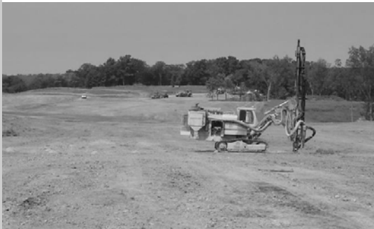
Drilling on the Front Straight