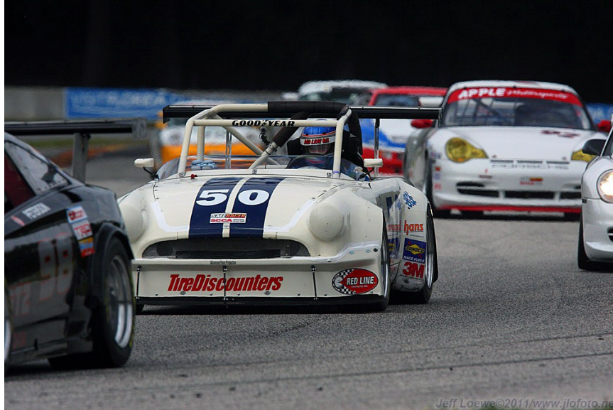
After qualifying 3 rd , Tom Patton had a 2 nd place podium finish at the 2011 Runoff's