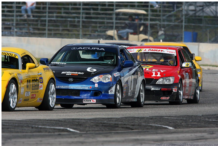
Bill Niemeyer started 10th and, after several position changes, finished tenth