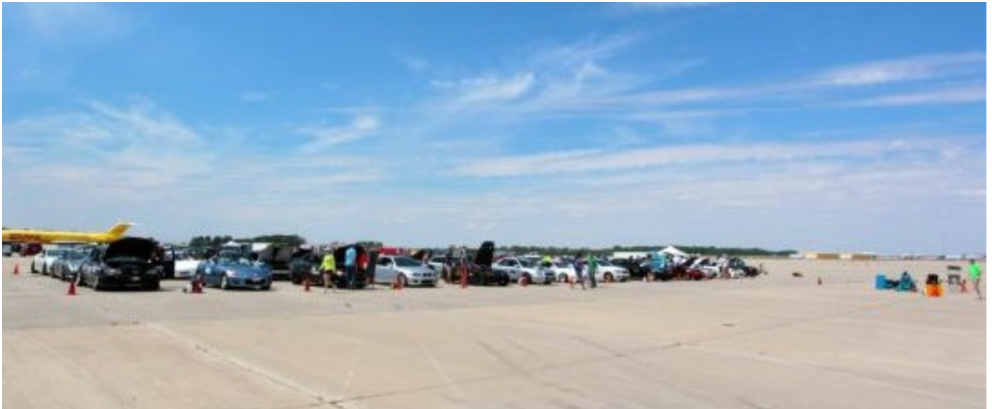
beautiful day good turnout