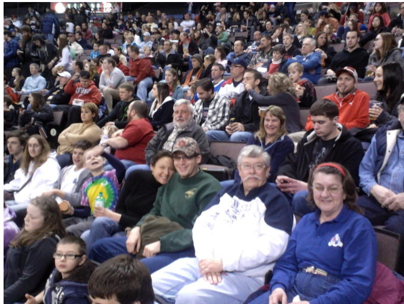
SCCA at the Cincinnati Cyclones Game