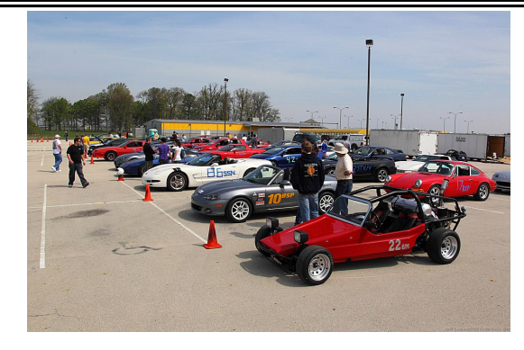
A very good turnout for the first solo of 2012 at the Wilmington Airpark

Your donated items and support are greatly appreciated. Items can be brought to the track and left at garage #1 or contact Bob Cowie 625-5584.