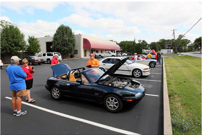
Good turn out for Tech Day in July getting ready for the IT Spectacular