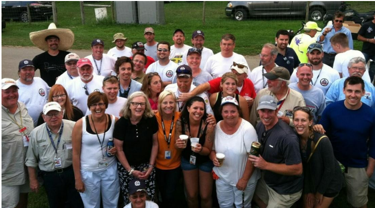
Worker Party 2013 Mid-Ohio

The solo season is slowly winding down. The end of July and the beginning of August were very busy in the solo community. During the weekend of July 27 and 28 we held two events on the pad at Wilmington. These were a great sneak peak of the phenomenal site that we were going to be using for the National Championship Tour the following week. The feed back from the two weekends was amazing! Everyone who attended the events had a great time and loved the site. Congratulations to all of our local class winners and all of those who trophied at the National event. There are only three more solo events on the calendar for the 2013 season. Our next event is a joint event with WOR and will be held at KilKare raceway in Xenia Ohio on Sunday, August 25. This will be our seventh points event of the season. Following that, we are hosting a Great Lakes Divisional event which will also be our final points event of the season on Sunday September 15 at the Wilmington employee lot. Our final event of the year is going to be a fun event also to be held on the employee lot at the Wilmington Airpark. The date for this event is Sunday, October 6. We hope to see you at one of our upcoming events.