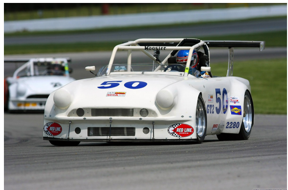
Tom Patton at the SCCA Super Tour