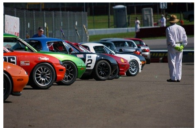
Spec Miata's wait for the call to the track during the 2013 IT-SPECTacular