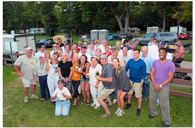
Do we call them the Wild Bunch The Cincinnati Region members at the Saturday night party during the 2013 IT SPECTacular