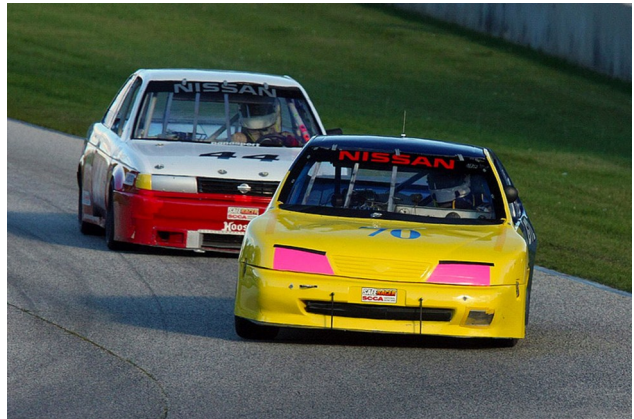
Rob Bax pushes Brian Floyd during the 2013 Runoffs GTL Race