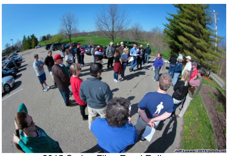
2015 Spring Fling Road Rally